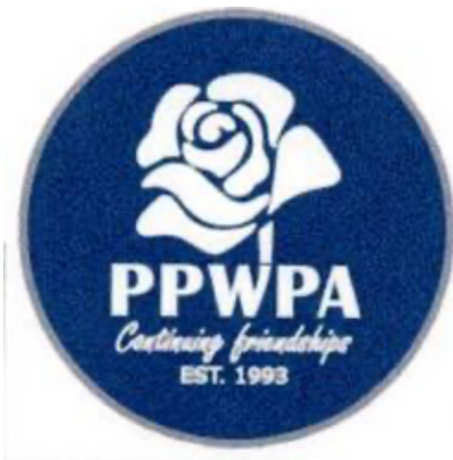
Challenge Coin - $15 or 3 for $40