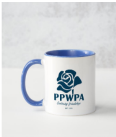
Coffee Mug - $15