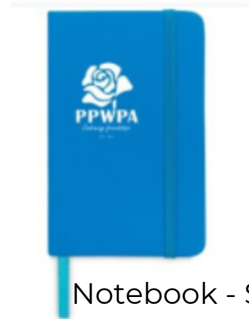
Notebook - $5