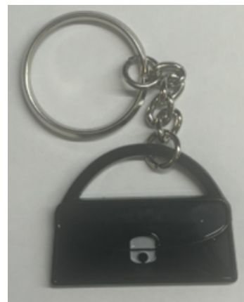
P/W handbag keyring - $5